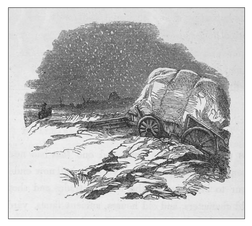
Figure 2. 'A Winter Scene,' from ch. VII, 'Our Old Town Flooded,' Thomas Miller (1857), Our Old Town (London: Brown and Co.), p. 163.

loss of life in town. Gainsborough, he remarks, quoting Othello , has suffered "moving accidents by flood and field":