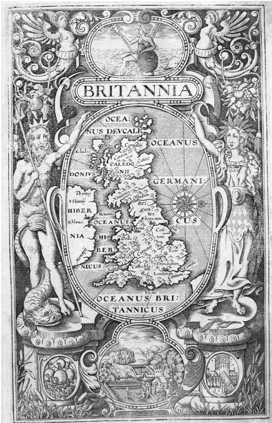
Figure 3: Frontispiece to William Camden, Britannia , trans. Philemon Holland (London, [1610]). General Reference Collection 456.e.16.