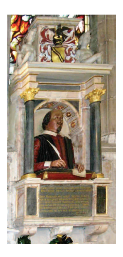
Fig. 1. William Shakespeare's funerary monument, Holy Trinity Church, Stratford-upon-Avon, Warwickshire. Modern-day photograph.

and property. If we recoil from this equation, then it is because we, unlike the young Shakespeare and his contemporaries, believe we know where our next meal, our warmth, light, and our night's sleep are coming from. Creativity is inspired by hungry bellies just as much as by the satisfied paunch traced in the Holy Trinity effigy, and the periodic crises of sustenance that have shaped the tumultuous history of these islands have been fuel for poets and playwrights as much as for politicians. As readers and writers, we are at the heart of that process.