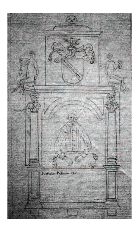
Fig. 2. William Shakespeare's funerary monument, Holy Trinity Church, Stratford-upon-Avon, Warwickshire. This sketch was made in 1634 by William Dugdale for his 1656 publication The Antiquities of Warwickshire . The original autograph manuscript is Dugdale's Warwickshire (vol. 4, p. 933) in the Dugdale Library at Merevale Hall, Warwickshire, residence of the present Sir William Dugdale.